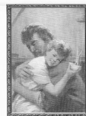
En el Día de los Padres

Las tarjetas para la novena del Día del Padre durante el mes de junio están disponibles en el templo y en la oficina parroquial. Por favor anote el nombre de su papá, abuelo, padrino, tío, esposo, hermano, hijo y comparta estos beneficios espirituales ofrecidos durante esta novena. Asegúrese de llevar la tarjeta y regresar el sobre a la oficina o en el templo. La donación que se recabe será enviada a los sacerdotes misioneros en los países necesitado de nuestra ayuda.