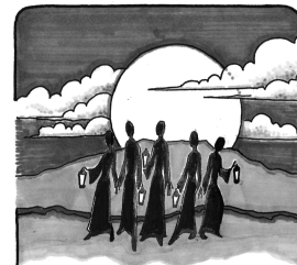
Five wise virgins brought oil for their lamps

— Wis. 6:12-16; 1Thes. 4:13-18; Mt. 25:1-13