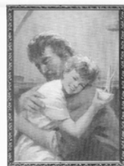
En el Día de los Padres

La donación que se recabe será enviada a los sacerdotes misioneros en los países necesitado de nuestra ayuda.